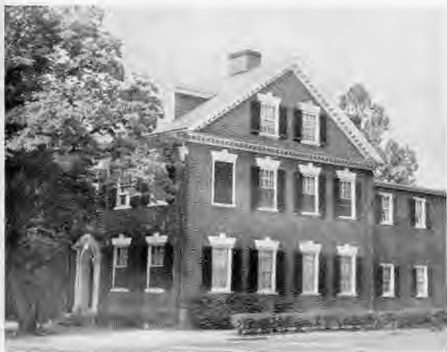
THE EDMUND JENNINGS LEE HOME AT 428 NORTH WASHINGTON STREET.