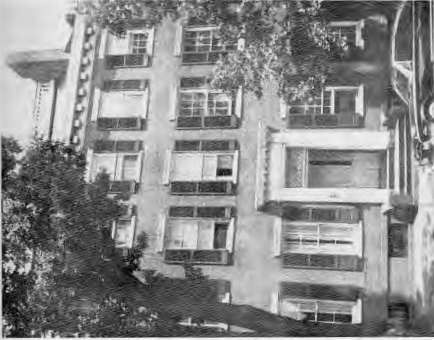
THE LATER FITZHUGH HOME WHERE ROBERT E. LEE VISITED "COUSIN MARIA" IN MAY 1869, AT 215 NORTH WASHINGTON STREET.