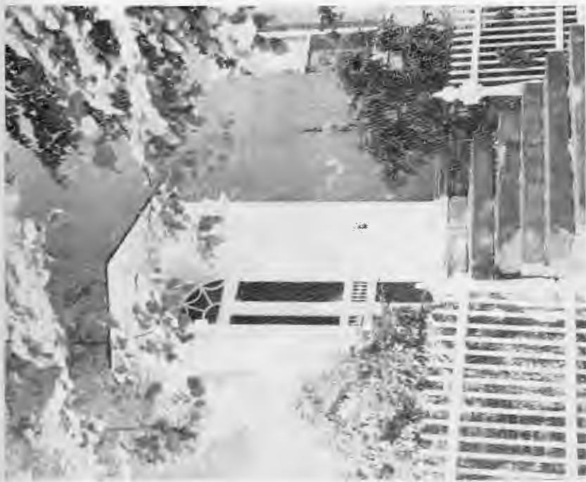
BOYHOOD HOME OF ROBERT E. LEE, WHICH BELONGED TO HIS FITZHUGH COUSINS, AT 607 ORONOCO STREET.