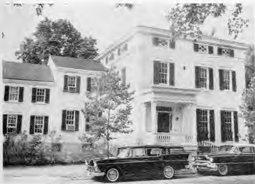
THE PHILIP RICHARD FENDALL-RICHARD BLAND LEE HOME AT 614 ORONOCO STREET.