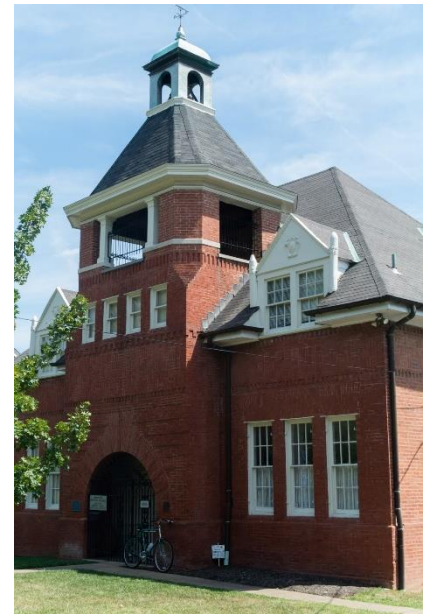
The historic Hume school, home of the Arlington Historical Museum

We need docents. If you like history, this is the volunteer activity for you. You'll learn all about local history, meet your community, and talk with fellow history enthusiasts. The museum offers a self-guided tour so docents don't lead tours but are there to field questions and enable visitors to see the schoolroom upstairs and ring the Hume School bell. At a minimum it's only three hours a month on a Friday, Saturday, or Sunday afternoon of your choice. No previous experience is required, just a love of history. Email: info@arlingtonhistoricalsociety.org