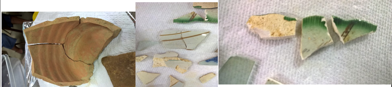
AHS Volunteers hard at work cleaning