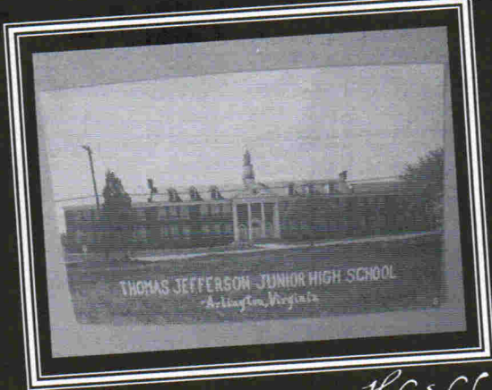
Old Thomas Jefferson Junior High School Walter Reed Drive near Columbia Pike