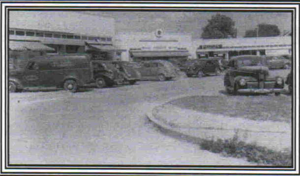
Westmont Shopping Center at Columbia Pike and Glebe Road