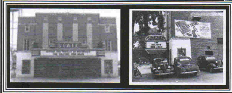
State Theatre on Lee Highway