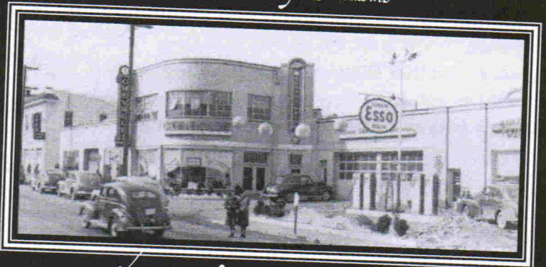
Kenyon-Peck Chevrolet on Wilson Blvd