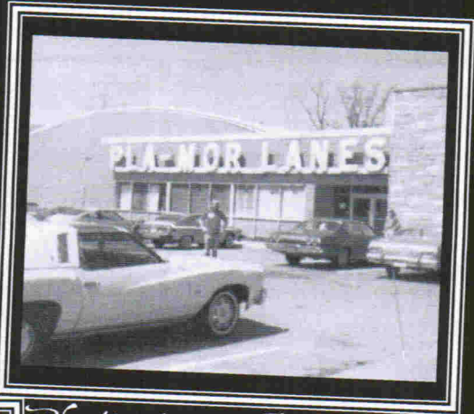
Pla-Mor Lanes on Fairfax Drive