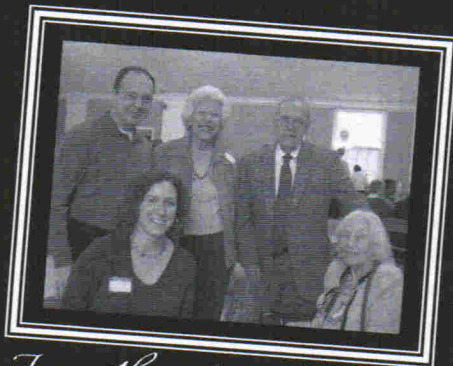
Five Historical Society Presidents