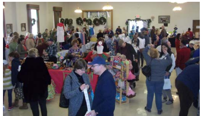
RIGHT: Attendees browse holiday gift items and bid at a silent auction. AHS earned nearly $400 from sales at the Holiday Boutique.