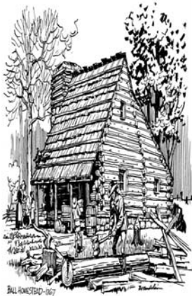
The Ball-Sellers House in 1767