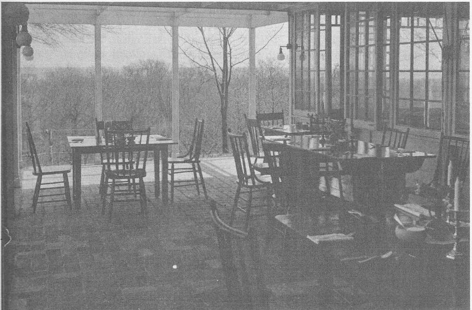
The brick dining area had a beautiful view; the main dining room was to the right.

The postcards are marvelous views and we certainly treasure these. I believe the one may be our only view of the interior. You mentioned having hundreds of photos of the area and we hope you will consider having these housed in Arlington where they would be accessible to you, your family and the community. The society has a photographic archives and another