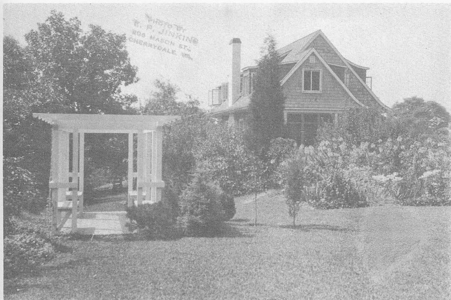
Gray Gables, the family home, in the mid-1920s.