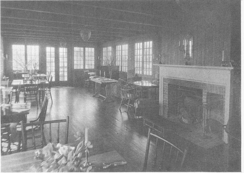
The main dining room had several windows that served as natural light and a fireplace which added ambiance.

source might be the Community Archives in the Virginia Room of Arlington's Central Library (1015 N. Quincy St., Arlington, Va. 22201). I would dearly love to visit with you, record your recollections in an oral history interview, and see the pictures. May I call you to discuss this? Many thanks for your letter and the postcards. I hope to talk with you soon.