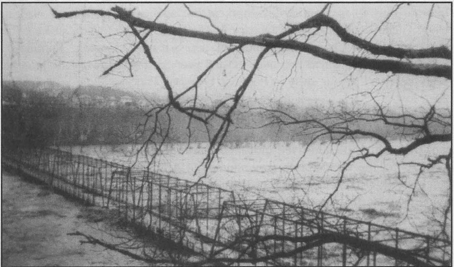
Chain Bridge, March 19, 1936.

There are a few remnants of what was, according to Mr. Shosteck, in 1934 a "fertile wooded area": two limited areas of woodland with their ferns and wildflowers, a few trails, three small sections of a Civil War trench, and a two lane stretch of Glebe Road.