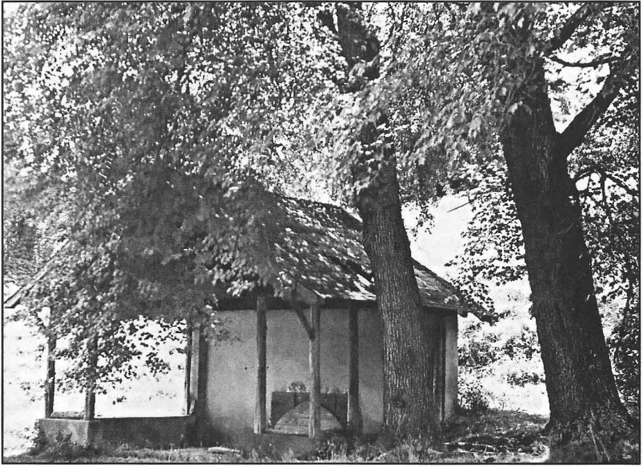
Virginia Room, Arlington Library