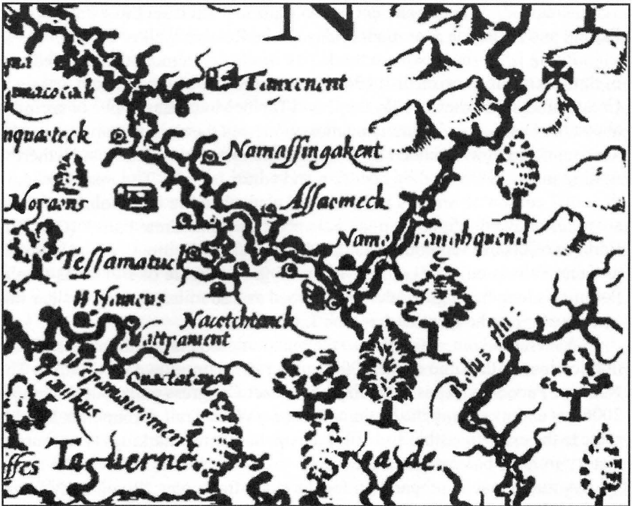
This portion of the map Smith published in 1612 shows the area along the Potomac that is now Arlington, near the Indian village of Nameroughquend. Note that north is to the right.

cliffs of rocks, we saw it was a clay sand so mingled with yellow spangles as if it had been half pin-dust.”