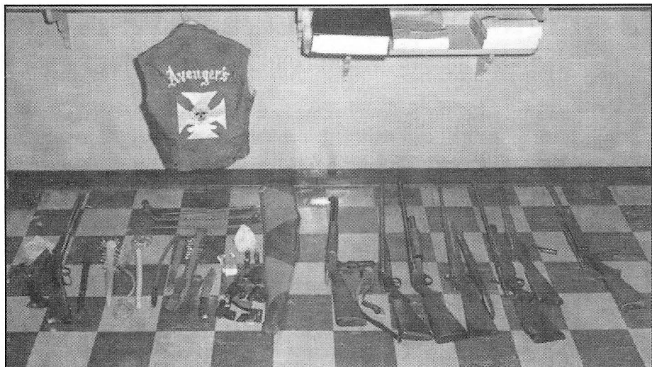
Gang weapons and a jacket confiscated by police the night of the Lee-Harrison shootout.