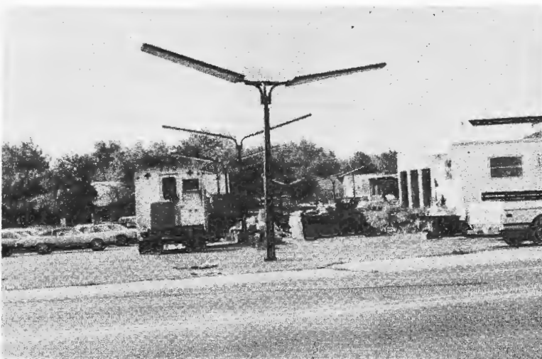
1972 picture by James Barron.

The dealership closed in the sixties and the building was demolished, but more construction on the site is anticipated.