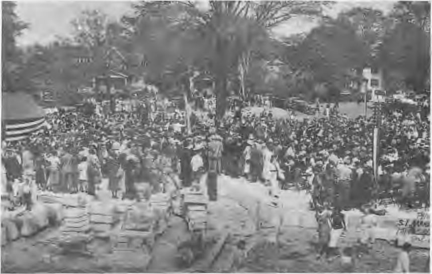
1937 picture by S. I. Markle (in AHS Archives).