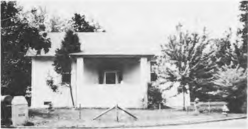
1950 picture, copied from Glencarlyn Library collection.