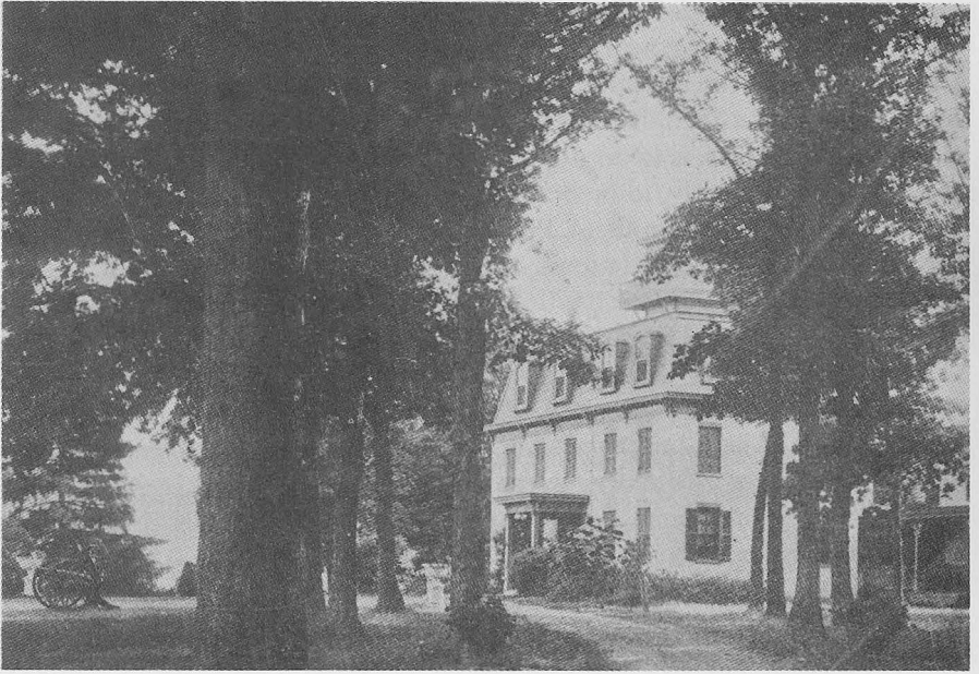
Warwick as it appeared in 1899. The cannon on the lawn was captured with Jefferson Davis.