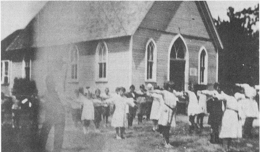
The Barcroft School, 1921. Calisthenics for Pupils.

These dedicated women taught in the period from 1907 to 1925, in a home and in "the Barcroft Community House" from the time a school was first authorized in Barcroft until the opening of the new brick school in 1925. 6