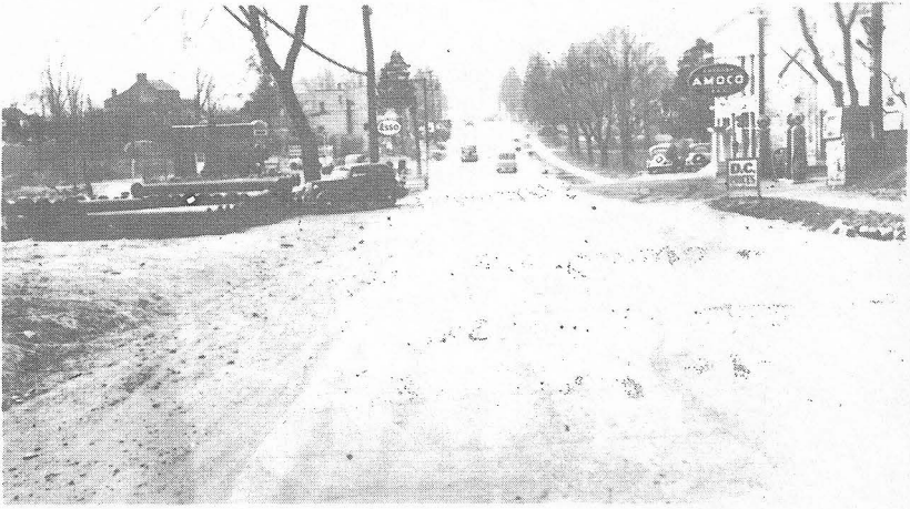
View of Columbia Pike from South Barton Street, taken in March 1939.