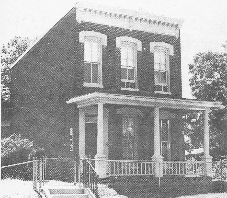
The Harry Gray House on South Quinn Street, which originally faced Columbia Pike. It was the first red brick townhouse in Arlington County, built about 1881.

herds down the Pike to the plant. This practice was discontinued about 1905 when a new spur route was available near the river.” She describes the condition of the road as “a narrow two-lane dirt road — rocky rough, and dusty, and in rainy weather, a quagmire of mud with deep ruts. It was travelled by draymen, drovers, buggies and walkers. The road wound through the sleepy countryside with many twists and turns and over many hills.” 28