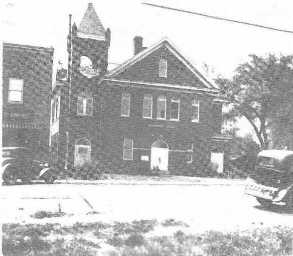
Columbia School on Columbia Pike just west of Walter Reed Drive was replaced by Patrick Henry School.