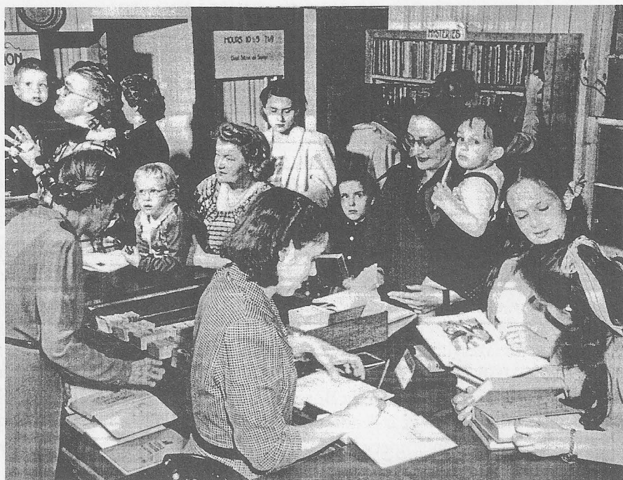
Falls Church Public Library, May 1951.