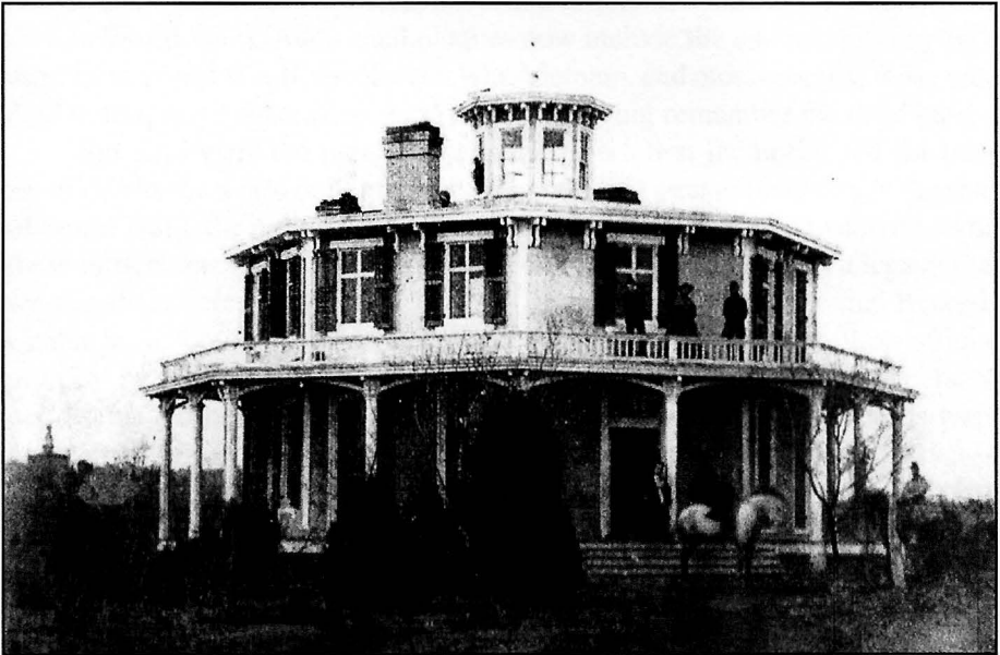
Figure 5: Eastern View of Fort Albany, 1862 (Detail) by William Lydston.