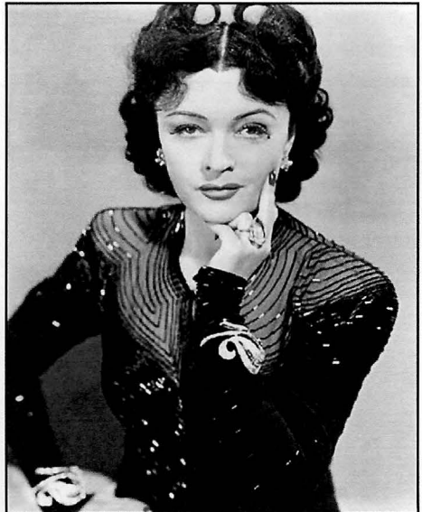
Pola Negri, publicity photo for 1943 film "Hi Diddle Diddle."