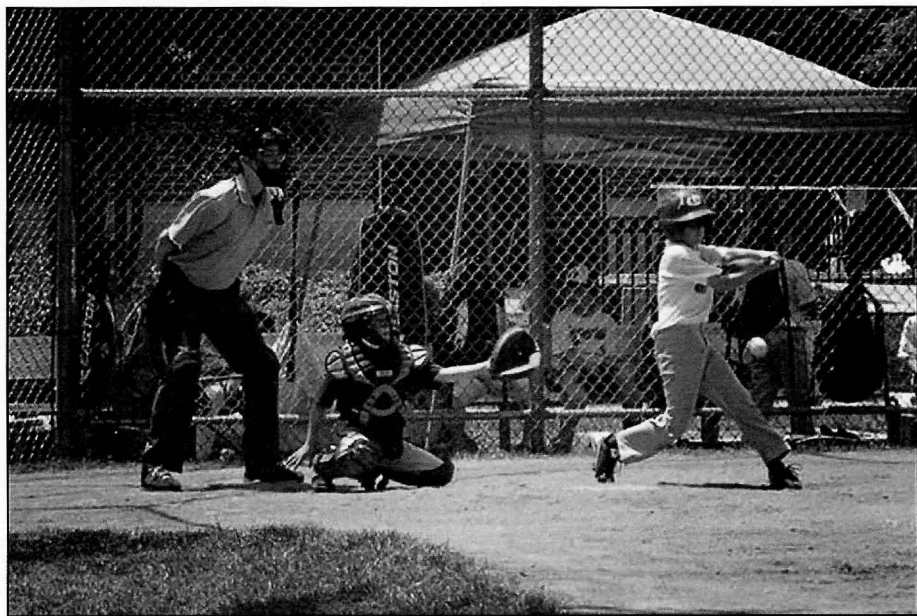
Arlington Babe Ruth League Website