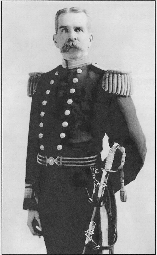
Marymount University Collection