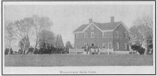
1899 Official Golf Guide

As we know from the club's current logo, the year for the club's establishment has been listed as 1894 for as long as anyone alive can remember—most likely because it is believed that it was this year--when the earliest members first incorporated the club as Washington Golf Club. In early 1895 their