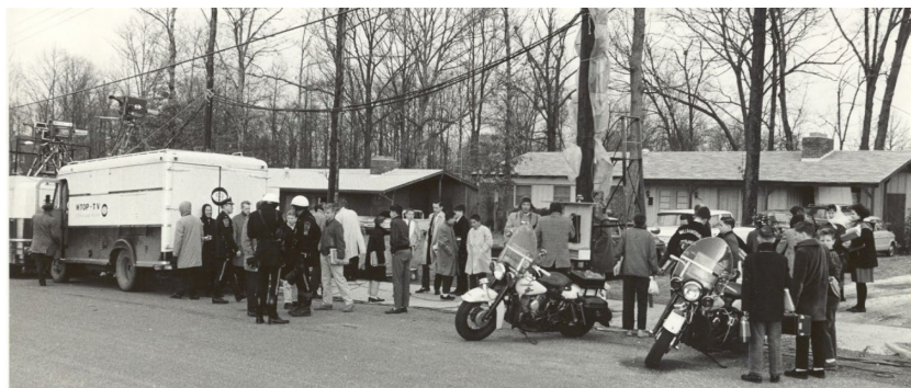
The press waited outside the Glenn house (on the right) during his launch waiting for statements from the family and visitors to the house like Vice President Lyndon John and the Director of NASA.